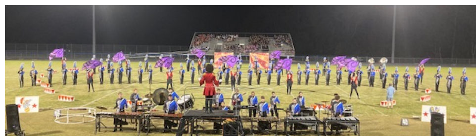
2021-2022 East Lake High School Silver Sound Marching Band

Your tax deductible sponsorship supports the East Lake High School Marching Band & Guard, Concert Band, Wind Ensemble, Orchestra, Jazz Ensembles, Winter Guard, and Percussion.